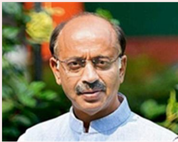
Shri Vijay Goel Hon'ble Minister of State (Sports & Youth Affairs) Government of India

The year 2017 is marked as the year of 'Japan-India Friendly Exchanges' to enhance people-to-people contact and cross cultural exchanges between Japan and India for building youth leadership. The year 2017 also marks the 60 th Anniversary since the Cultural Agreement came into force in 1957. This event in the year of Japan India Friendly Exchanges is very important for the mutual understanding, inter-cultural friendship, promoting youth leadership and people-to-people contact between India and Japan. I am happy to know that as part of the celebration of 2017 as the year of Japan India Friendly Exchanges, Ship of World Youth Alumni Association - India' is organizing a series of lectures/interactive sessions in 8 Japanese Universities and other institutions between 16 and 26 April, 2017.