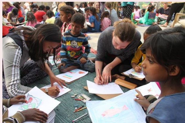
University students from Norway