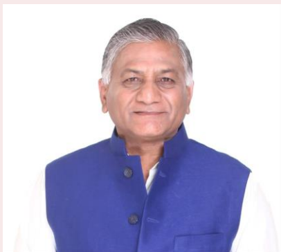
Hon'ble Gen. (Retd.) Dr. V.K. Singh Minister of State External Affairs Government of India

I am glad to hear that you are going to spread the messages of Swami Vivekananda and Mahatma Gandhi to Japanese Youths on the occasion of the year 2017 being celebrated as the Year of India-Japan Friendly Exchanges'.