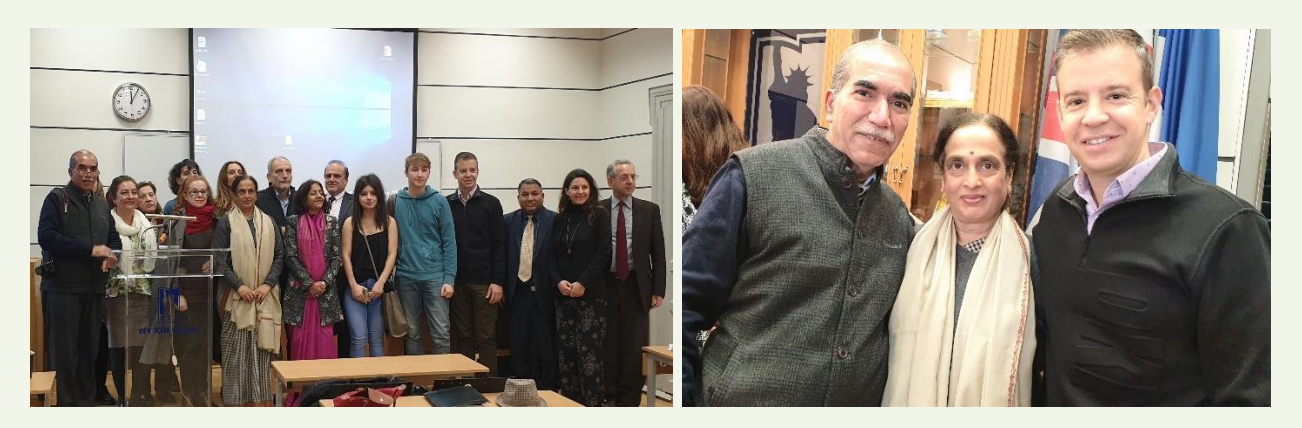
The second lectures tour was conducted in April and May 2019 with AAs from Australia, Fiji, New Zealand, and Japan.

5. SWYAA Australia had facilitated us in getting Visa for our visit to Australia by providing an invitation letter.