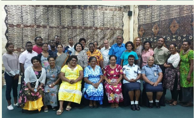
Country Report 2019