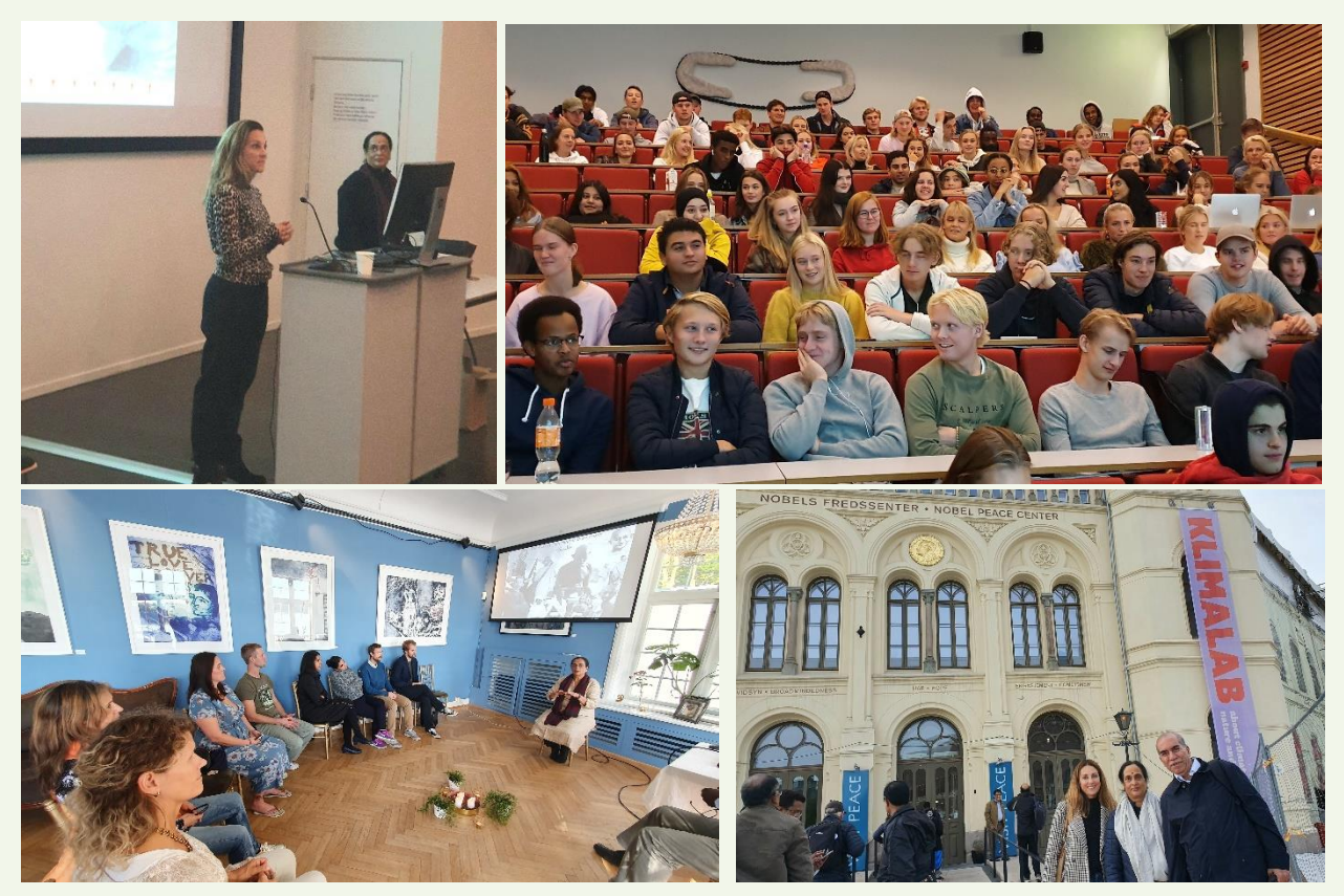
A get-together of Ex-PYs in Oslo was held and later they took us on for a tour of the city.