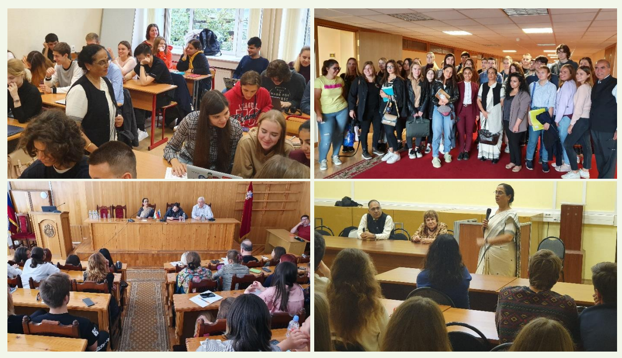
They also helped to coordinate with the Embassy of India, Moscow for organizing eight lectures in various Institutes and Colleges in Moscow.

10.SWYAA Norway organized one lecture at Nesbru High School, Asker, Norway and facilitated the lecture at Sjoholmen Art and Culture House, Oslo.