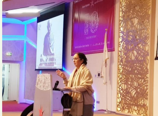
They also organized a get-together of Ex-PYs in Manama for meeting and knowing each other. Later they organized a tour of the National Museum of Bahrain.