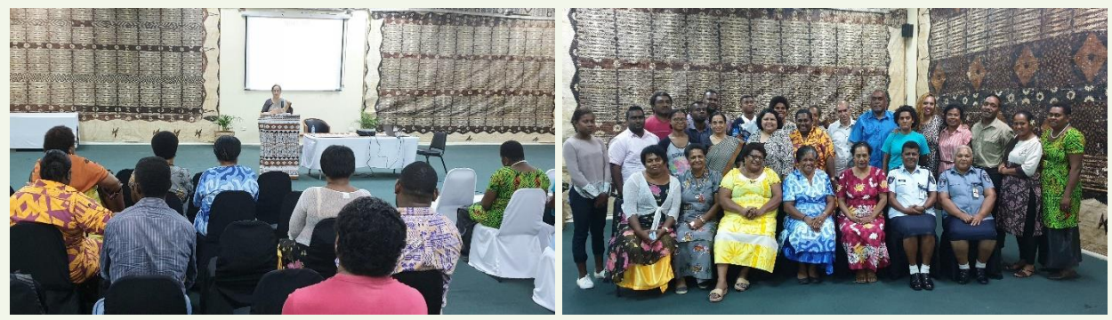
They also facilitated in organizing lectures at Fiji National University Lautoka, and University of the South Pacific, Suva.

6. SWYAA Fiji had organized a lecture at the Studio-6 Conference Centre Suva in which Ex-PYs from Fiji and other dignitaries also participated.