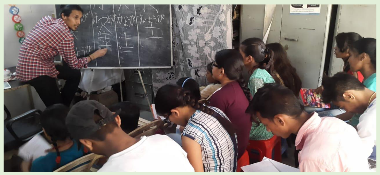
In addition, in the SWYAA Open School, Japanese culture and language were introduced through songs and books to the students.

Activities in the Open Schools included teaching multi-level, multi-age and multi-grade children in language, arithmetic, and general science. For this, we used games and play-based curriculum, child-friendly, joyful activities for the holistic development of the students.