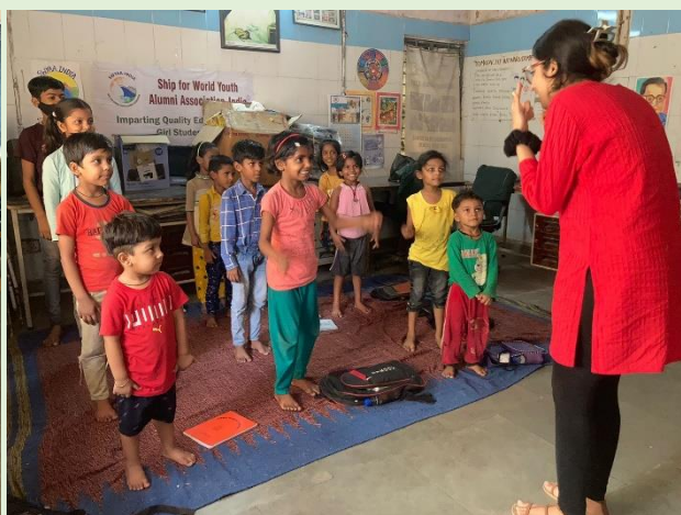
Country Report 2021